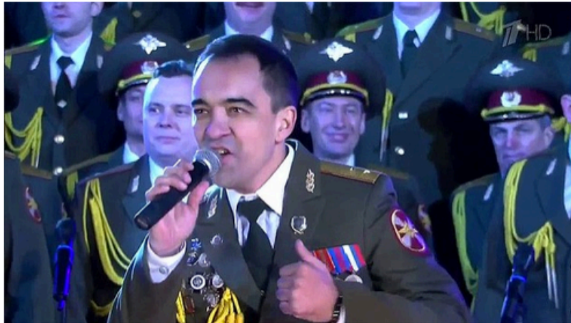
Sochi Olympics ... Red Army Choir's cover of Get Lucky by Daft Punk has been seen by millions.

Tweet 1 Recommend 0 Share 2 submit Email article Print